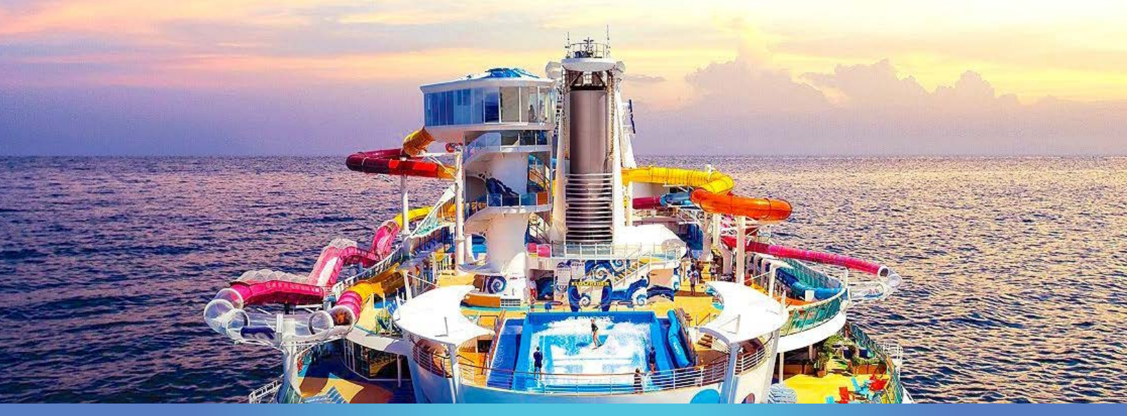
February 10 - 14, 2025