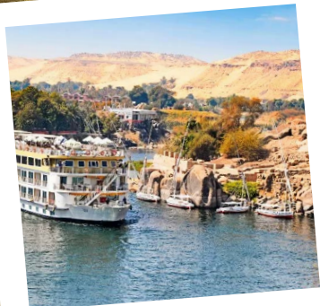
Nile River Cruise