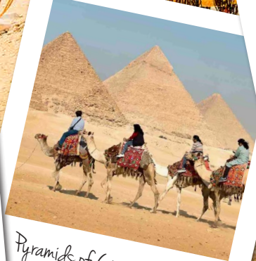
Pyramids of Giza